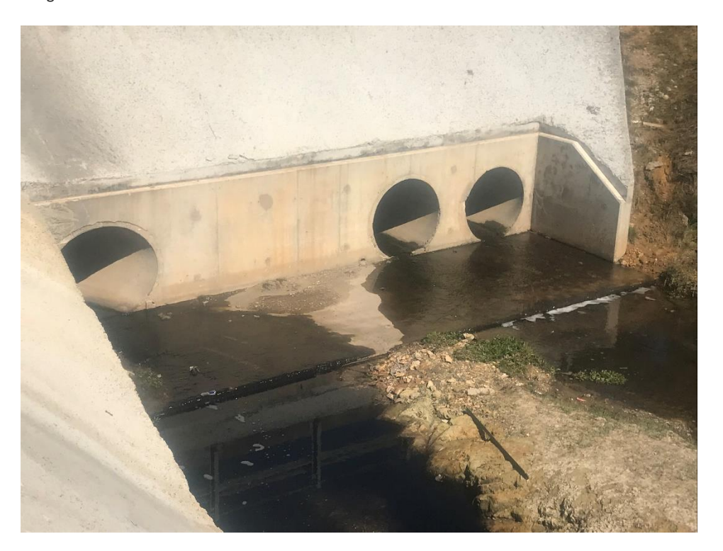
Image 2 – Pipe culvert outlet (showing the internal flow (left) and inflows from adjacent site