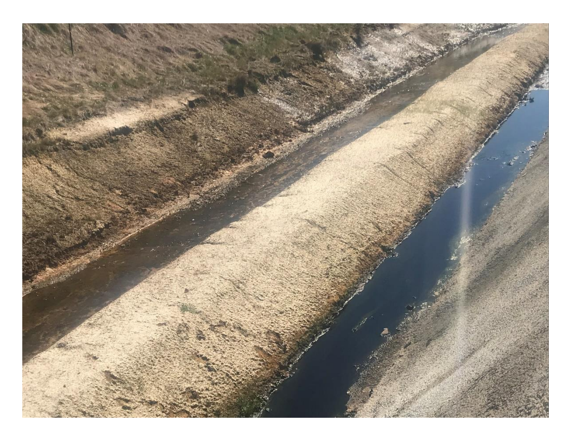
\label{lem:lemmage} \mbox{Image 3-Perimeter swale to the basin and overflow swale to the discharge point.}